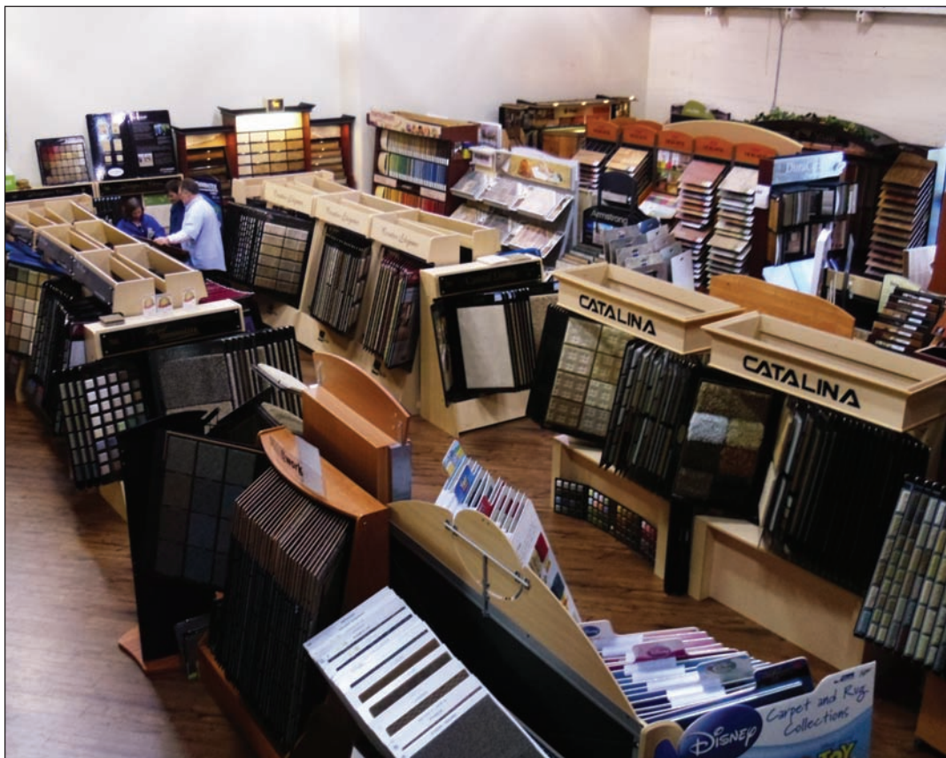
Visit our 8,000 sq. ft. Showroom